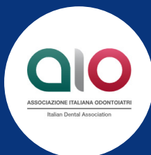
Italy — AIO