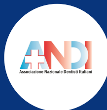
Italy — ANDI