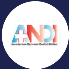
Italy - ANDI