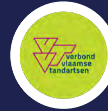
Belgium – VVT