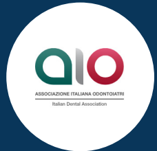
Italy - AIO