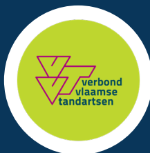
Belgium – VVT