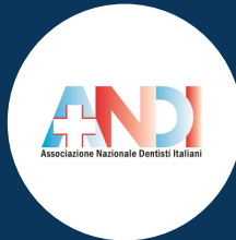
Italy - ANDI