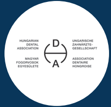
Hungary - Hungarian Dental Association